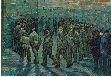
Prisoners' Round by Vincent van Gogh

Screens are killing us. That's not a new statement. The destruction of our attention due to increasing technology usage is one of the main topics of our age. And rightfully so.