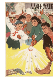
Killing the Sparrows

Middle managers are the sparrows. They’re declared pests — too many layers, too slow, too expensive. Flatten the org! Move faster! Let AI handle coordination! So companies eliminate M1s, turn managers into tech leads running pods, and let the teams self-organize with AI tools.