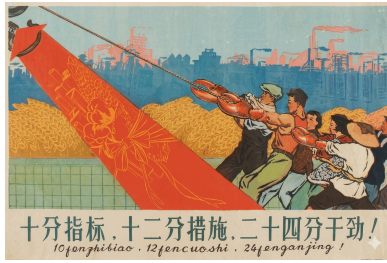
Reporting Grain Production to the Central Committee

Then someone — there’s always someone — builds a leaderboard tracking how many prompts you wrote this week, how much of your code is AI-generated, your ranking versus your team, versus your org, versus the entire company. One day your company announces: stop everything, it’s AI Week. Build something with AI. Show what you’ve got. You think you’re done after the hackathon? No no no. Now you have to promote it. Daily posts: look what I built, here’s how many agents I used, here’s how many skills I shipped. Pull in teammates. Pull in strangers. Ask for feedback. “Humbly.”