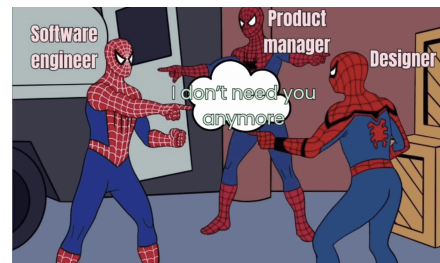
Engineering, PM, and Design scope creep

collaboration; the incentive structure says land grab. What looks like productivity gains is actually a war of all against all, where every function is simultaneously trying to prove it can absorb the others before the others absorb it.